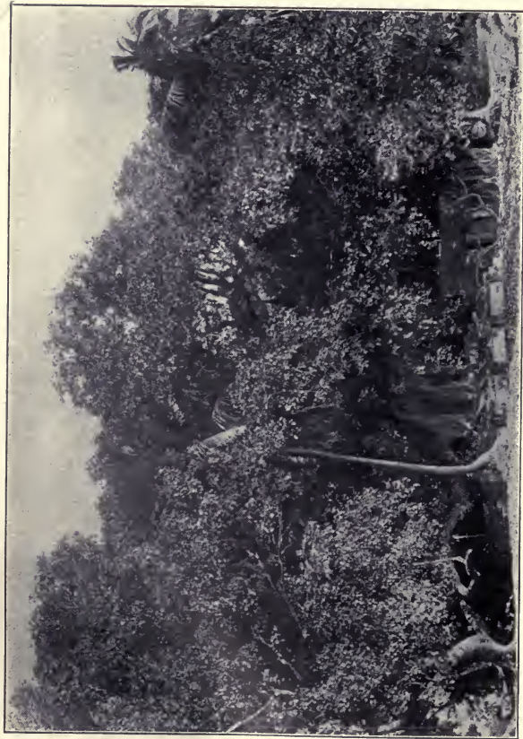
Râmakrishna's seat protected by the bent branch of the big tree